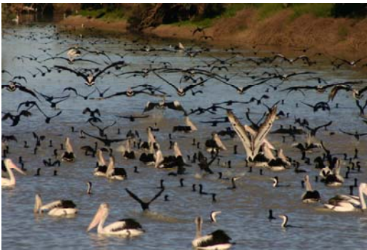
Try to count them, there were lots!

All I can say is that it was the most amazing journey, I have never seen so much water in the outback, never seen it so green and certainly had never seen so many birds. Watching close to 500 birds come down to feed on a shoal of fish in Eyre Creek and then disperse as quickly as they had arrived was one of nature's little treasures. Camped beside the flooded Eyre Creek in the Simpson Desert and watching mirror perfect reflections at both sunset and sunrise and taking a helicopter out of Birdsville into the flooded Simpson Desert are images that will stay with me for a long long time. Hopefully you will get to read the story I wrote for Overlander Magazine which should appear in the next month or so. In the meantime you can see a selection of the 1500+ photos I took in the Galley section of my website www.4wd.net.au