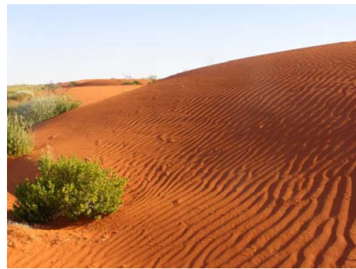
The Northern Simpson desert is magnificent