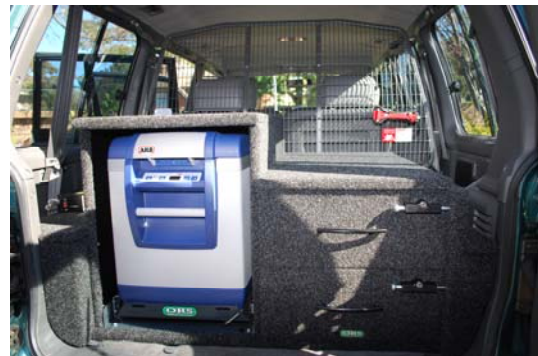
Off Road Systems build the best Storage units!

Moore of a 4WD equip tip. Recently, during the fitout of Project Pajero (Don't forget to read all about it on my website) I travelled out to Narellan to Off Road Systems to have them fit one of their excellent storage systems to the Pajero. During this visit I realized that the drawer system in the rear of my Landcruiser was actually an ORS unit. So after 8 years of hard four wheel driving all over Australia carrying the enormous weight of all my recovery gear, I think I am in a pretty good position to fully endorse the ruggedness and build quality of the ORS storage systems. So if you are looking for a quality storage system for the rear of your 4WD give Graham Jones a call at ORS on 02 4647 6322 and tell him Outback Vic sent you.