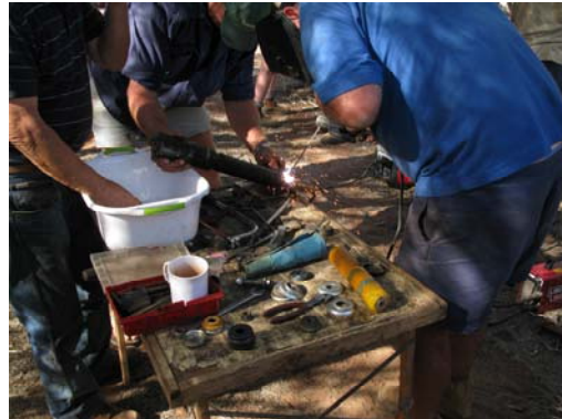
WD40 doing what he does best, making things that were crook, better again, using a welder!

Our bestest outback mechanic acka WD40 pondered the predicament for a while and then decided with some modification he could make one of his extra spare shocks for his Troopie fit the 100 series Landcruiser. So with welding rods and grinders and all sorts of bush mechanical experience, he set to manufacturing a mounting bracket that would allow the Troopie shock to fit the front end of a 100 series Cruiser.