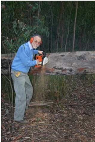
See, I do work hard on my trips.

The greatest fear about deciding to clear the track is that there might be another even larger tree down further on, we had already cleared a number of trees so we knew no-one else had been on this great 4WD track for some time, so the chances of another forest giant blocking our way was pretty good.