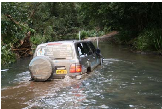
This is a deep crossing, up to my knees!

Anyway, lady luck was with us, and with all lending a hand, we cleared the track and moved on eventually emerging from the dark forest around 7pm on Sunday night. It's these little adventures that make a trip sometimes and although it meant arriving home late I'm pretty certain everyone enjoyed the challenge, I know I did!