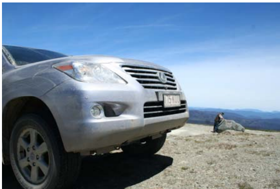
You could be at this lookout next week.

Anyway, if you are still wondering what to do over Easter or the school holidays in April, come on down to the High Country with us, we have vacancies on both trips and your presence will inject some much needed revenue back into the local communities.