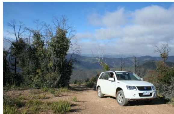
The High Country looks fantastic at this time of year.

I just saw this week's Getaway program on Channel 9 and they were talking about how all the tourists were staying away from the mountain country in Victoria due to the wildfires. It was obvious how badly this was affecting all those establishments that relied on the tourist dollar and many of these businesses may simply have to close up shop. There was a real plea to get the tourists to come back.