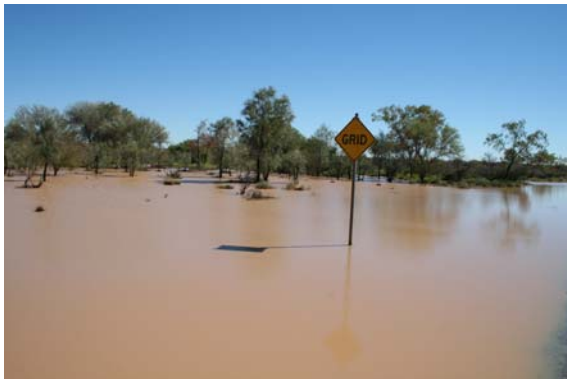
Water everywhere in outback Queensland