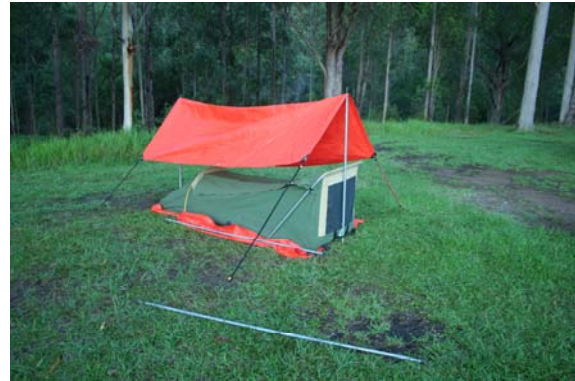
Alex's effort at keeping the rain off