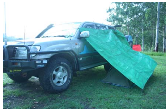
And Vic's dry sleeping arrangements