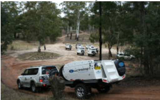
6 Ultimate camper trailers at Castle View

Just last weekend we conducted a special off road camper trailer training course for our friends at Ultimate Campers. It certainly made for a sight to see 6 4wdrives with 6 Ultimate Campers hooked up to them parading around my property. We also had a new 200 series Landcruiser attend this course and to say that they are a superb machine off road is an understatement. There has been a bit of criticism for the new Landcruiser mainly aimed at its high cost, but I can assure you that their owners are very very pleased with their outlay. By far the best 4WD available at present.