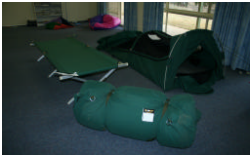
The OzTrail swags and stretchers are yours for a few dollars .

Have you ever bought something and then before you've even used it, discovered that you don't really need it? Well, Irene & Dave have done just that, they purchased a couple of brand new swags and stretchers with the view of using these on some of their private camping trips. But, before they got to use them they suddenly found it a lot easier to take their caravan and camp in it! So now they have two swags complete with foam mattress and two stretchers for sale. Brand new the swags are going for just $200 each and the stretchers are for sale for $30 each, give me a call on 9913 1395 if you are interested.