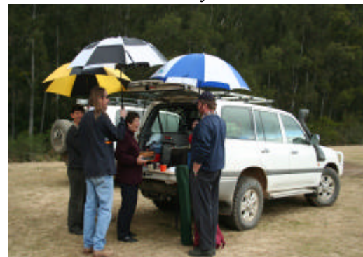
It didn't rain, they just wanted to show off their new umbrellas.

This has to be one of the best trips we offer. Great scenery both days, great 4Wdriving, great lunch stops, great accommodation, a great meal in the local Golf club and always great weather. I only had a small group a couple of weeks ago, but we had a great time. What else can I say?