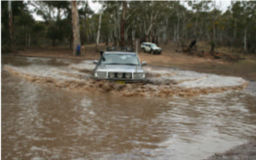
Our new water crossing at Castle View

We have had heaps of driver training courses over the past couple of months. To say that it is cold at Braidwood at this time of year is an understatement but we still get loads of bookings (thank you) the skid pan at Castle View has become the river crossing as it has remained full of water over the past couple of months, yes we have had that much rain! We have had a couple of our standard driver trainings and an Advanced Driver Training where we got a lot of practise recovering vehicles out of bog holes and even getting through some bog holes that have not been conquered in several months.