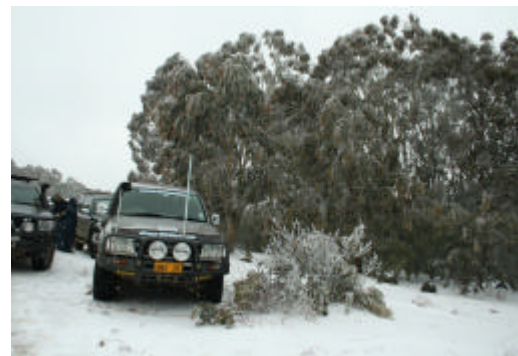
It snowed and snowed and snowed!

The idea of a snow trip is to drive through snow. There are not many places you can do that these days, but we have found a beauty. Thankfully the snow Gods rained down the white stuff on us. The first trip was a real cracker with lots of snow, mud and fun times. But the second trip was just out of this world with our accommodation being blanketed in 15 centimetres of snow and Sunday being spent driving in thigh deep snow at times. Of course Santa visited each group and the fun at night whilst it was snowing outside was just fantastic. Thanks to everyone who joined us on these trips, we had just the best time.